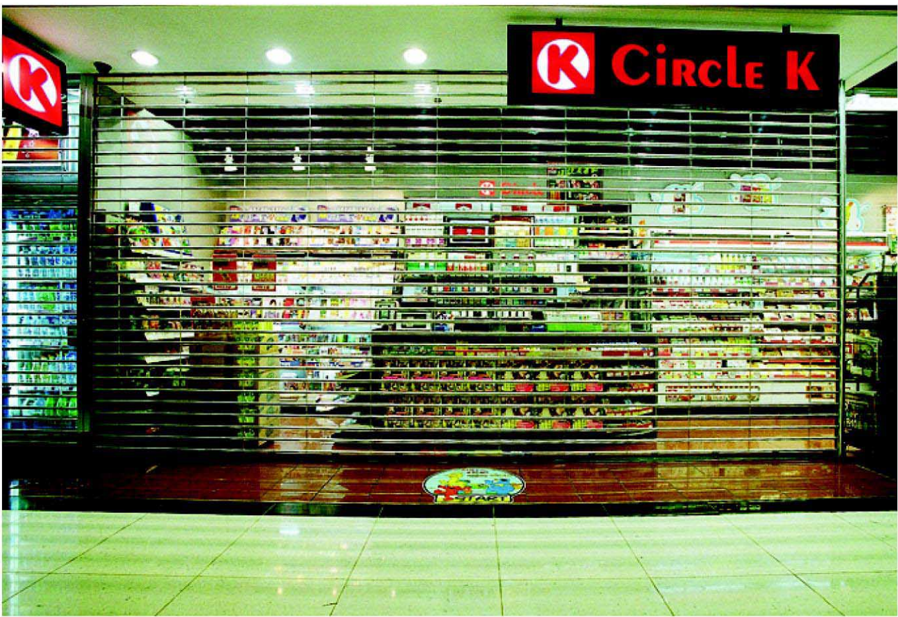
Clearseal II + Clearseal IIs roller shutter in a convenient store

(SEE THROUGH, VENTILATION FOR SECURITY PURPOSE & ENERGY SAVING)